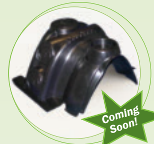
Side Port Coupler

ADS Service: ADS representatives are committed to providing you with the answers to all your questions, including specifications, and installation and more.